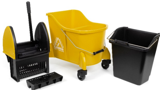
Disassembled, parts shown