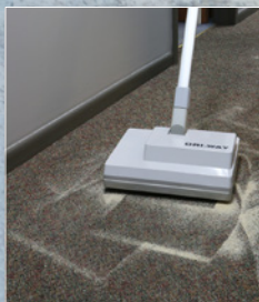
Agitate with a Dri-Way Jr. machine using a back and forth and crosswise motion working the compound into the carpet nap.