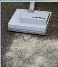
Sprinkle Dri-Way+® Compound generously over a 5' x 5' carpeted area to be cleaned.