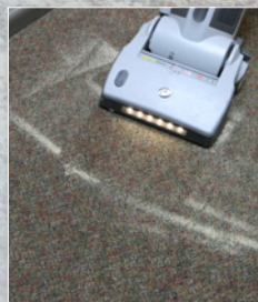
Allow area to dry while proceeding with another 5 ft. x 5 ft. area. Vacuum entire carpet with brush type upright vacuum.

Dri-Way+® Compound coverage is 550-650 square feet per 5 lb., depending on the type of carpet