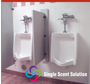
Single Scent Solution